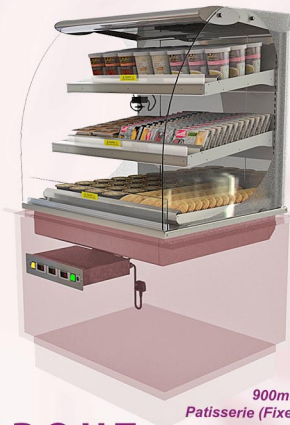
900mm Self Help Hot Patisserie (Fixed Back) Shown