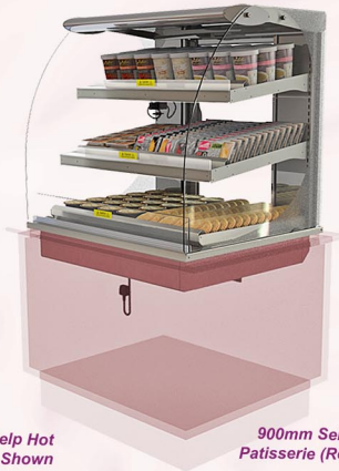
900mm Self Help Hot Patisserie (Rear Doors) Shown