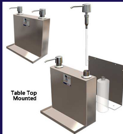
Table Top Mounted

(Wall Mounted). The bottom of the wall mounted sanitiser point is open under, so depending on the fixing height used, daily gel re-fill can be done by removing the top portion of the tap or by unscrewing the bottles from underneath.