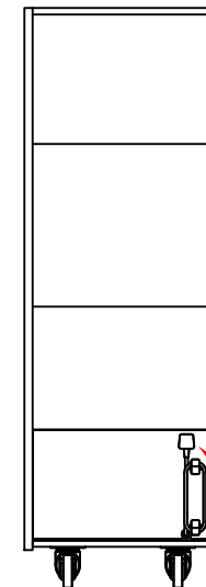
REAR VIEW (OPERATOR SIDE)

CONTROL PANEL (BEHIND LIFT-OFF PANEL) c/w DIGITAL CONTROLS FOR EACH HEATED TIER