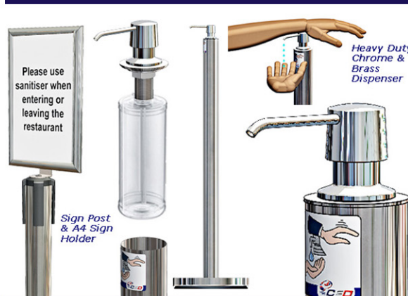
Sanitiser Post & Manual Pump Dispenser (Alcohol Gel \geq 60\% ).

Easy To Use. Just apply light pressure with the forearm to dispense 1-2ml of the sanitising gel. The 300 ml dispenser suits alcohol gel \geq 60\% & is simple to refill. It just lifts out of the post to enable unscrewing of the alcohol gel storage bottle. With its 360 degree operation, the CED sanitising post and dispenser can be strategically placed in multiple locations where hygiene is to be maintained, at the entrance to your establishment, reception desks, offices, changing rooms etc.