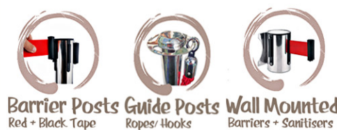
Barrier Posts Guide Posts Wall Mounted Red + Black Tape Ropes/ Hooks Barriers + Sanitisers