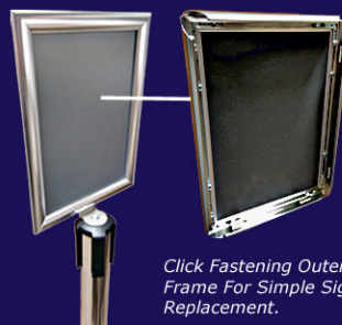
Click Fastening Outer Frame For Simple Sign Replacement.

This portrait orientation sign holder is an ideal communication point for advising on social distancing, customer flow or temporary access restrictions. It features a chrome effect frame with a simple click fastening outer perimeter, to allow access to fit or replace communication signs behind the plastic front. The visible printable area is 208mm (w) x 295mm (h).