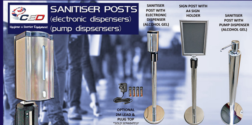
Sanitiser Post & Electronic Dispenser (Alcohol Gel \geq 60\% )

Easy To Use. By placing your hands underneath the electronic dispenser, the infra red detection cell discharges a measured dose of sanitising gel. The dispenser is simple to refill too. The sanitiser post features a large dispensing capacity of approx. 500 doses. The slotted window in the electronic dispenser provides easy monitoring of gel level. You can easily install or relocate the sanitising post and electronic dispenser in many locations as there is no electrical connection. The dispenser uses (4 x) AA batteries – not included. There is also an option for a UK plug with 2m electrical lead (Option Code ESPDP).