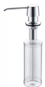
500 ml Dispenser = 280 Doses