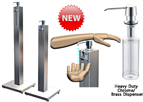
Heavy Duty Chrome/ Brass Dispenser