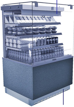
Option: Kickplinth (Set)