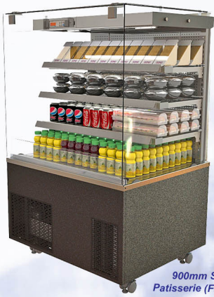
900mm Self Help Cold Patisserie (Fixed Back) Shown (Airflow In/Out Customer Side)