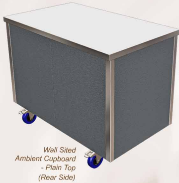
Wall Sited Ambient Cupboard - Plain Top (Rear Side)