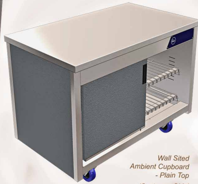
Wall Sited Ambient Cupboard - Plain Top (Customer Side)