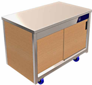
Model GWSACP3 Option GBEECWSA3 Shown