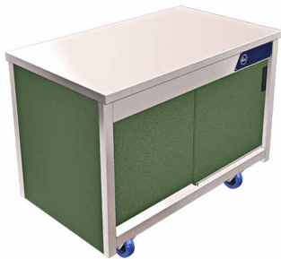
Model GWSACP3 Option GGRENWSA3 Shown

11 choices of leathergrain plastisol steel colours/ wood effect laminated steel for front opening sliding cupbd. doors/ sides.