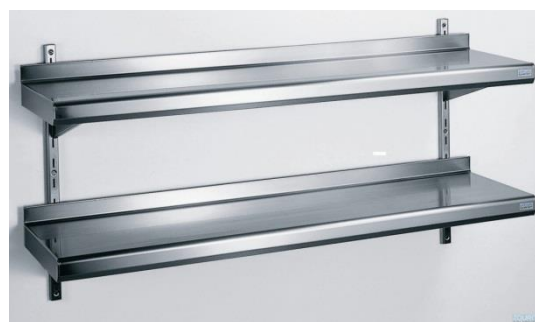
WIDTH 290 MM