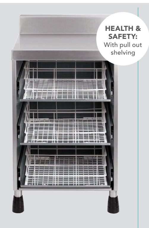
Plain Top Shelving Unit (Basket Rack Type)