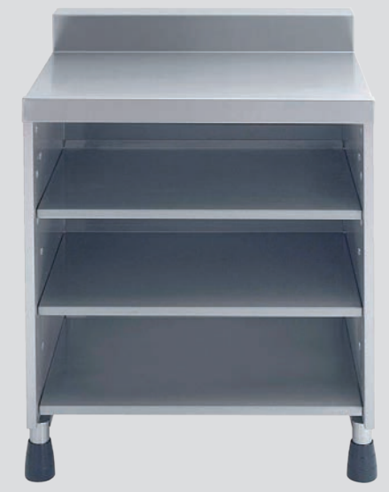
Plain Top Shelving Unit (Steel Shelf Type)