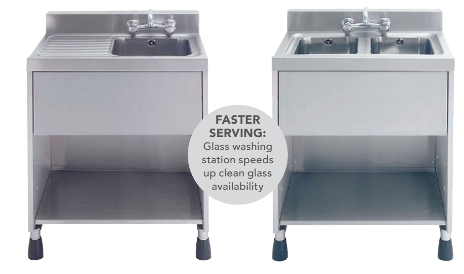
Single Sink Unit