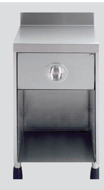
Single Drawer Unit