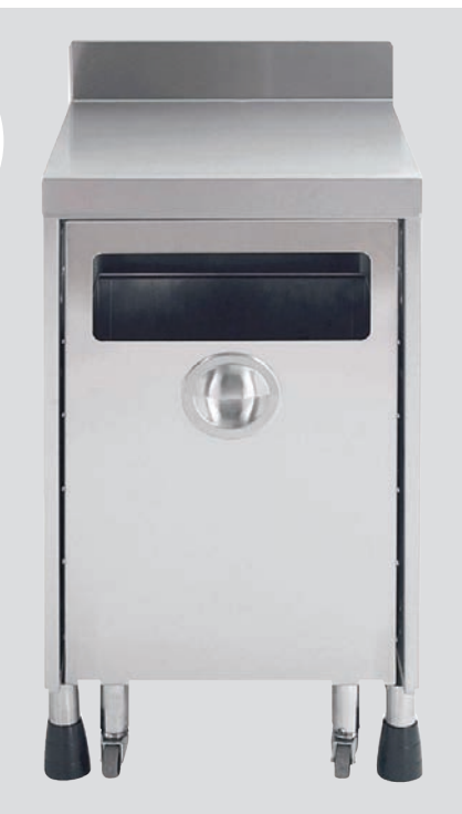
Plain Top Bridge (With Roll Under Bin)