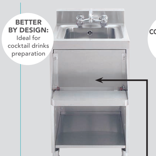
Blender Station Unit