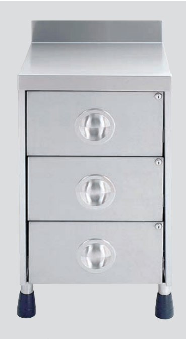
Three Drawer Unit