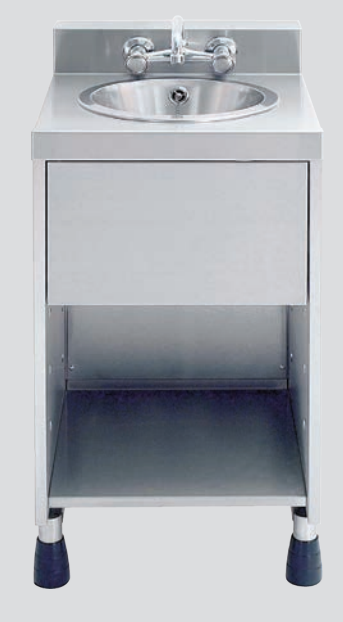
Wash Hand Basin Unit