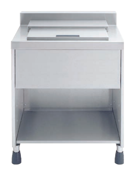
Ice Chest (With Lid)

Code Price IC45L £1,816 IC65L £1,977 IC80L £2,156 IC100L £2,311