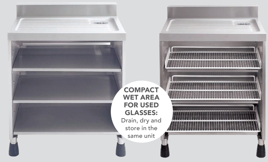
Drainer Top Shelving Unit (Steel Shelf Type)