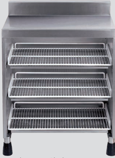
Plain Top Shelving Unit (Rack Shelf Type)