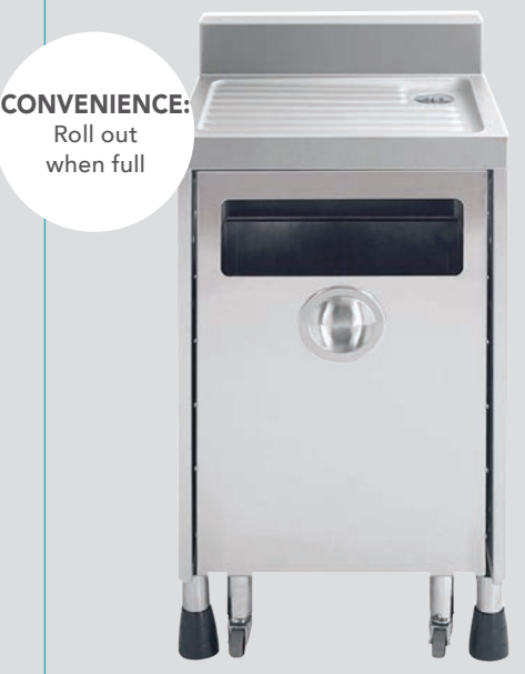
Drainer Top Bridge Unit (With Roll Under Bin)