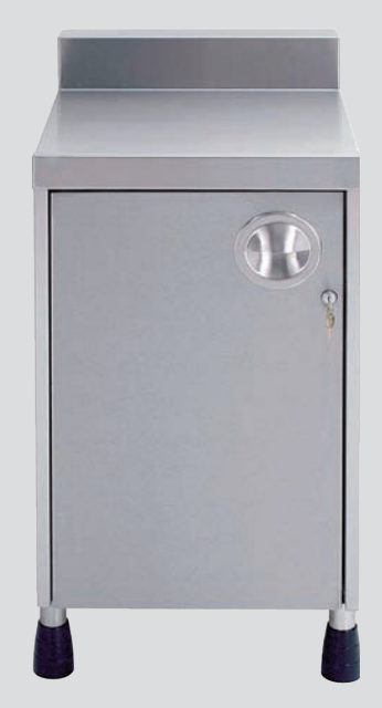
Storage Cupboard Unit