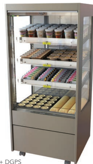
Model MMH900L + DGPS shown (Glazed Side Panels)