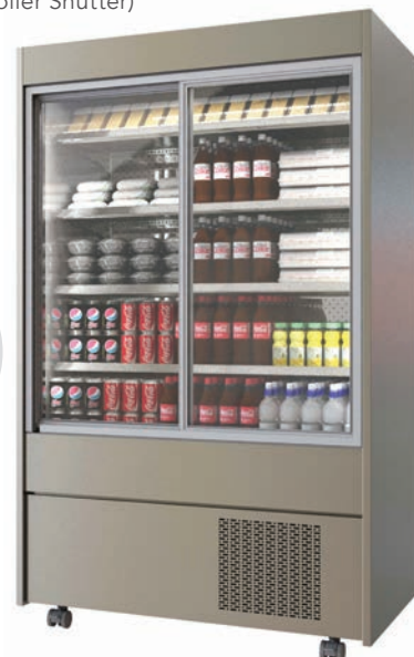
Model MM1200LDHT shown (Sliding Doors)