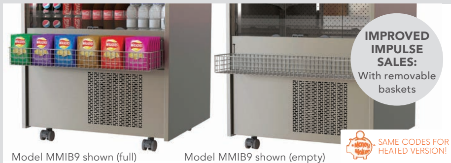
Model MMIB9 shown (full)