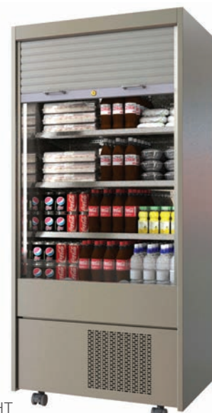
Model MM900LRHT shown (Roller Shutter)