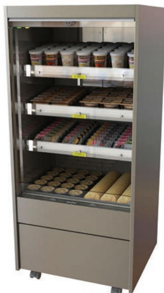
Model MM900LHT shown (Night Blind)