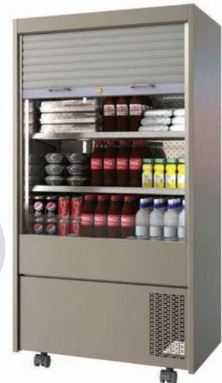
Model MM900SRHT shown (Roller Shutter)

HIGH SECURITY: Twin locking shutter system