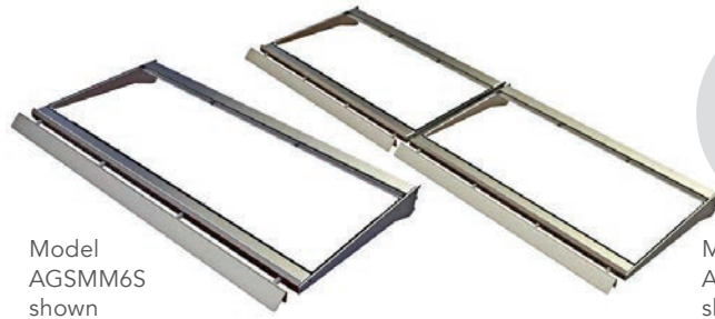
Model AGSMM6S shown

Ideal where product displayed is not predominantly bottle storage.