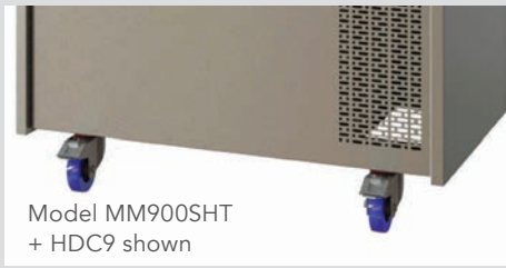
Model MM900SHT + HDC9 shown