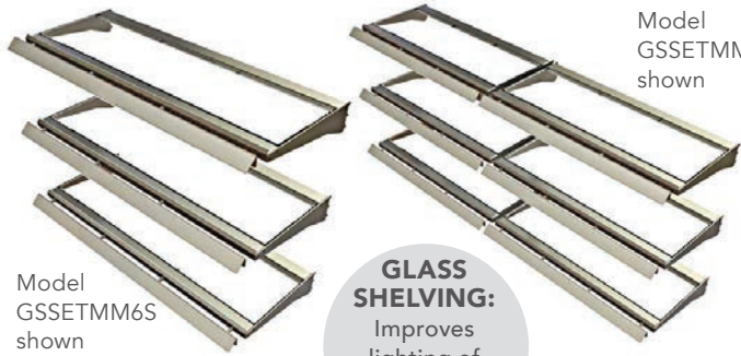
Model GSSETMM6S shown

Set of 10 mm thick toughened glass shelves, for enhanced product display.