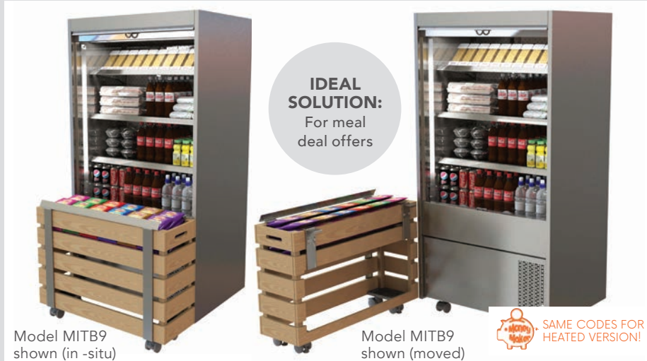
Model MITB9 shown (in-situ)