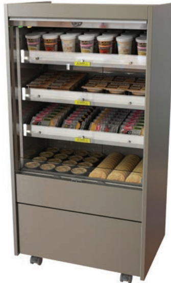
Model MMH900S shown (Night Blind)