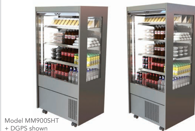
Model MM900SHT + DGPS shown