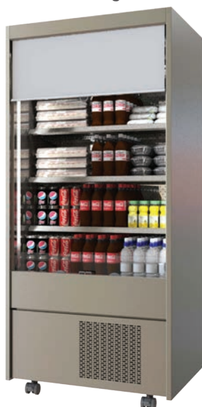
Model MM900LHT shown (Night Blind)