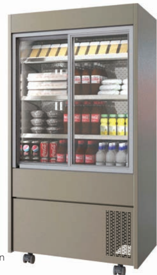
Model MM900SDHT shown (Sliding Doors)