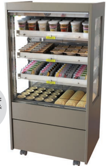
Model MMH900S + DGPS shown (Glazed Side Panels)