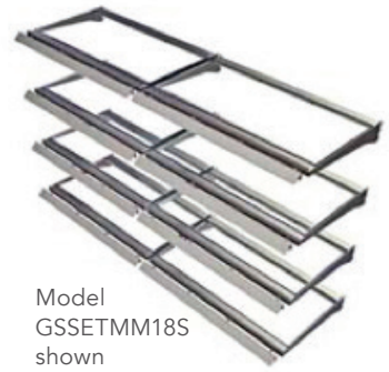
Model GSSETMM18S shown