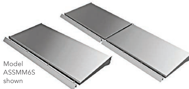
Model ASSMM6S shown