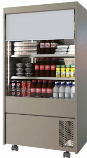
Model MM900SHT shown (Night Blind)