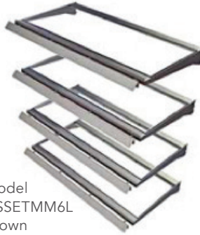
Model GSSETMM6L shown